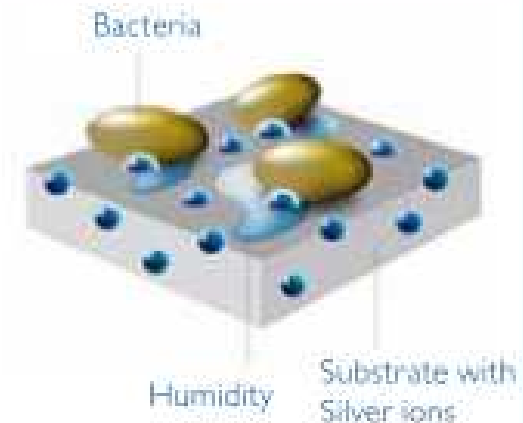
Bacteria altered by Ag +